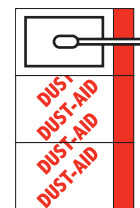
3inONE Silicone on Cleaning Adhesive (top view)